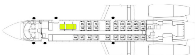
1 stretcher config.